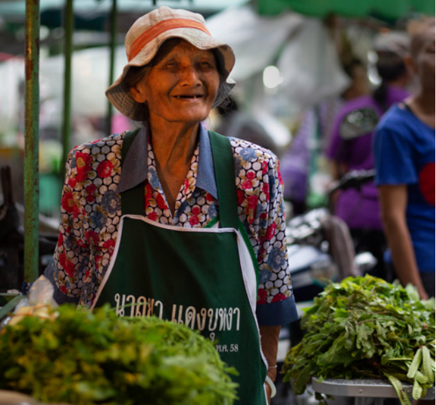
Many informal workers in Thailand begin work at an early age and continue to work after age 65.

www.wiego.org WIEGO Statistical Brief Nº 20 | 7